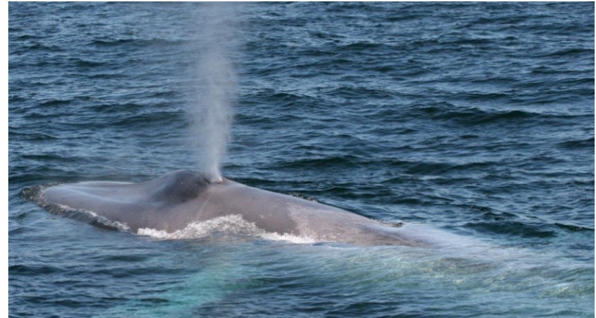
Blue whale blow

Blue whales are the largest creature ever to have lived on Earth. Here are some amazing facts and figures about these incredible creatures.