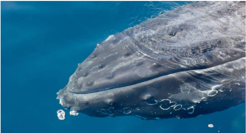
Humpback whale TIM STENTON

Whales are amazing! Here are some incredible facts about whales and their lives in the oceans.